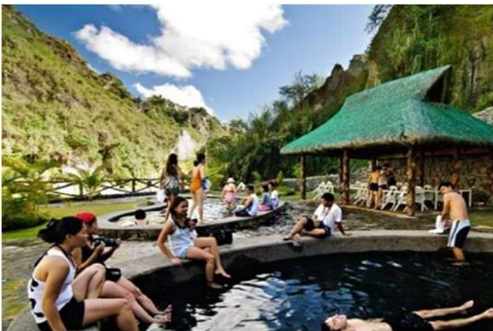
PUNING HOT SPRING