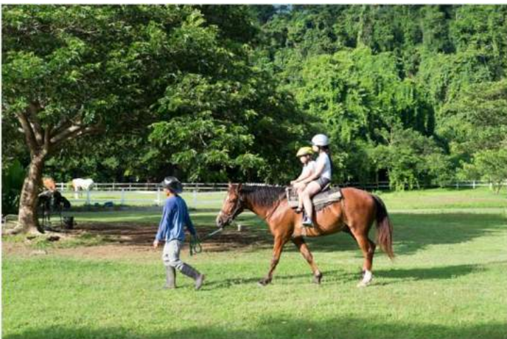
HORSE BACK RIDING